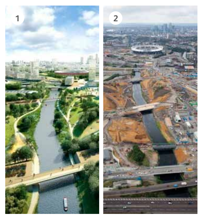
(1) Anticipated scheme layout; (2) New river profiles during construction

Significant bank reprofiling works were undertaken to lower the bank and reconnect the channel with its floodplain. Areas of land previously dominated by low-value riparian vegetation were lowered to create a floodplain that could also be used for flood storage purposes. Vegetation clearance works were aimed at allowing landscape and amenity benefits to be recognised by opening up the river for the public.